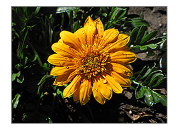
Sunbathers Gold Coast Gazania flowers