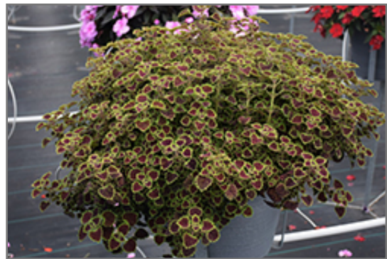
Burgundy Wedding Train Coleus