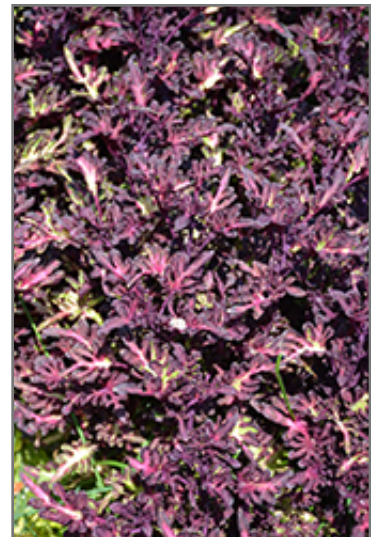
Merlin's Magic Coleus foliage