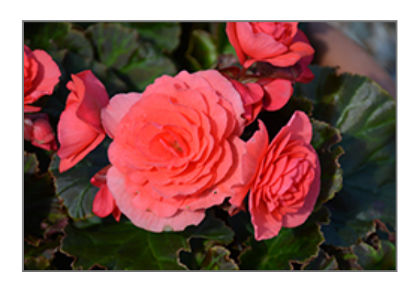
Solenia Dark Pink Begonia flowers

17999 WCR 4 Brighton, CO, 80603 phone: 303-775-9629 www.incolorme.com