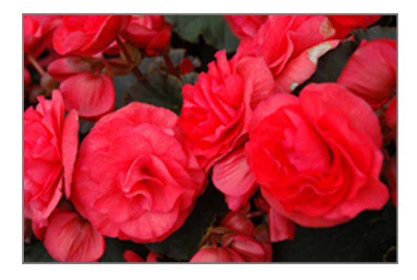
Solenia Dark Pink Begonia flowers