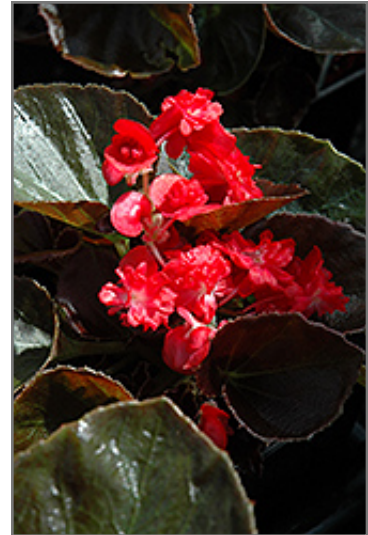
Doublet Red Begonia flowers

Doublet Red Begonia is recommended for the following landscape applications;