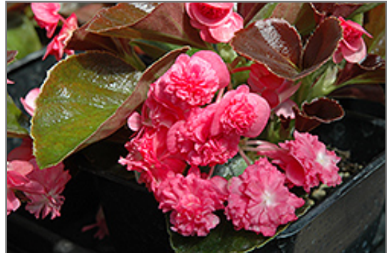
Doublet Rose Begonia flowers

Doublet Rose Begonia is recommended for the following landscape applications;