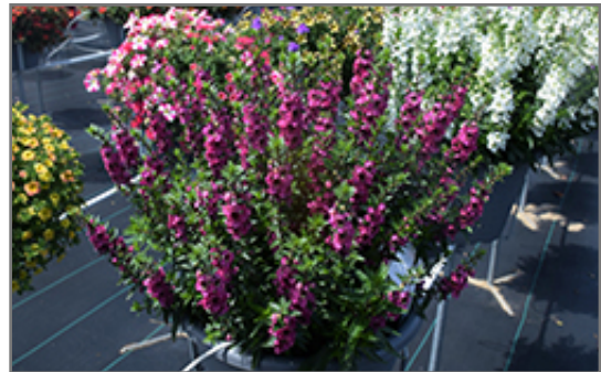
Archangel Raspberry Angelonia in bloom