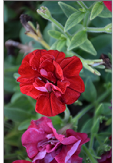
SweetSunshine Red Petunia flowers

SweetSunshine Red Petunia will grow to be about 10 inches tall at maturity, with a spread of 24 inches. When grown in masses or used as a bedding plant, individual plants should be spaced approximately 20 inches apart. Its foliage tends to remain low and dense right to the ground. This fast-growing annual will normally live for one full growing season, needing replacement the following year.