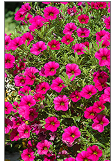
Cabaret Rose Calibrachoa flowers