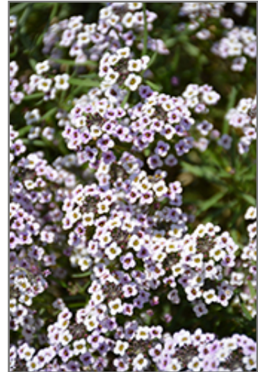
Blushing Princess Sweet Alyssum flowers

Blushing Princess Sweet Alyssum is recommended for the following landscape applications;