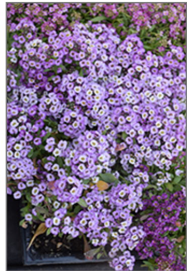
Clear Crystal Lavender Shades Sweet Alyssum flowers

Clear Crystal Lavender Shades Sweet Alyssum is recommended for the following landscape applications;