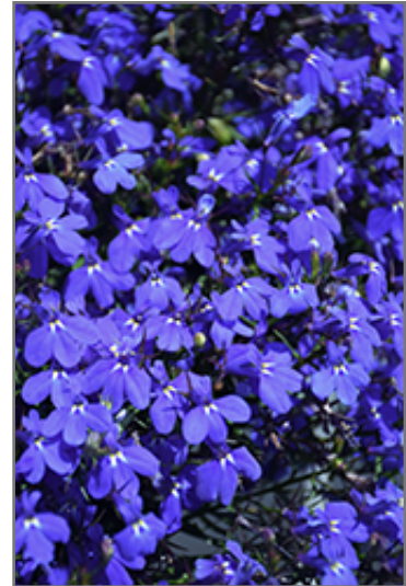
Techno Blue Lobelia flowers