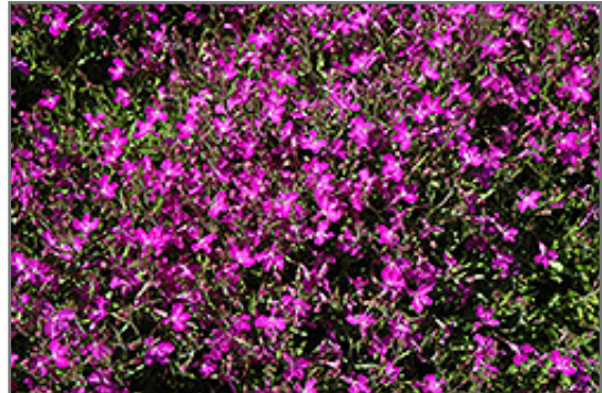
Techno Violet Lobelia flowers

Techno Violet Lobelia is a fine choice for the garden, but it is also a good selection for planting in hanging baskets. Because of its trailing habit of growth, it is ideally suited for use as a 'spiller' in the 'spiller-thriller-filler' container combination; plant it near the edges where it can spill gracefully over the pot. Note that when growing plants in outdoor containers and baskets, they may require more frequent waterings than they would in the yard or garden.