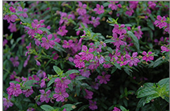
Allyson Mexican Heather flowers