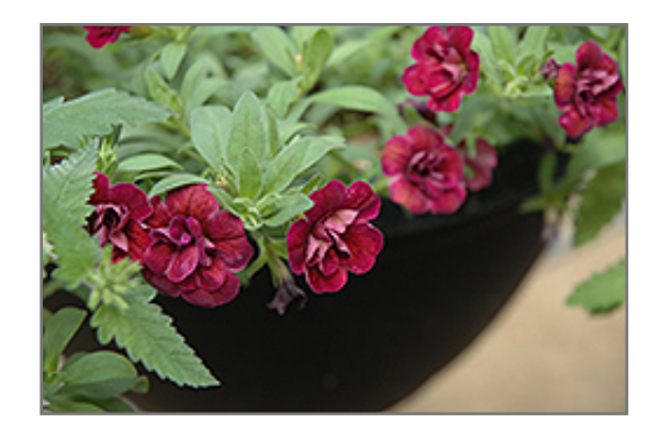
Superbells Double Plum Calibrachoa flowers