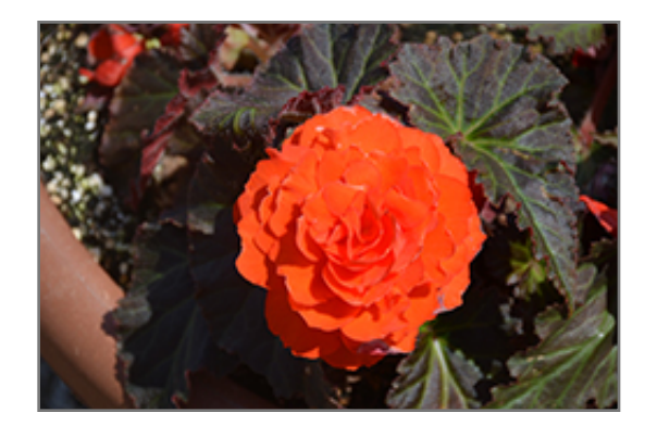
Nonstop Mocca Deep Orange Begonia flowers