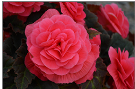
Nonstop Mocca Pink Shades Begonia flowers