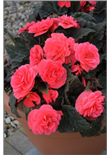
Nonstop Mocca Pink Shades Begonia in bloom

Nonstop Mocca Pink Shades Begonia is recommended for the following landscape applications;