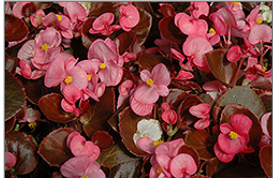
Nightife Rose Begonia flowers