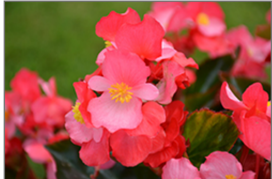
Surefire Rose Begonia flowers