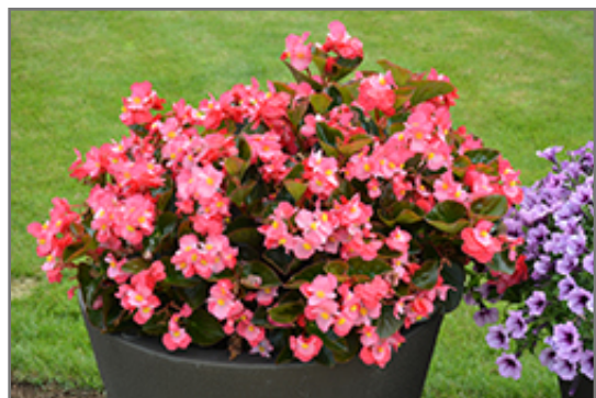
Surefire Rose Begonia in bloom