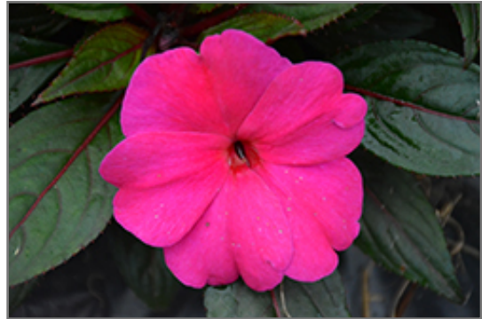
Magnum Blue New Guinea Impatiens flowers