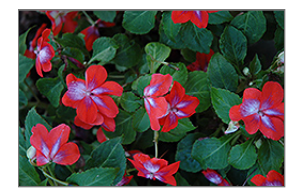
Patchwork Cosmic Orange Impatiens flowers