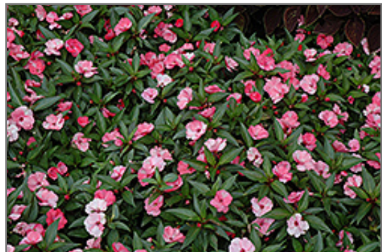
SunPatiens Spreading Pink Flash New Guinea Impatiens in bloom