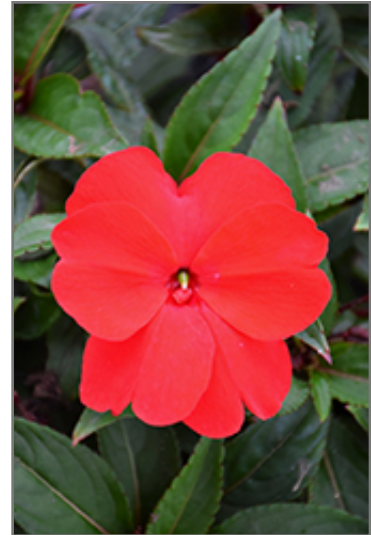
Florific Red New Guinea Impatiens flowers