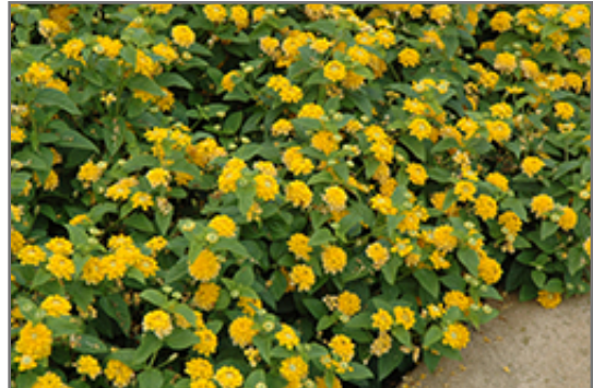
Little Lucky Pot Of Gold Lantana flowers