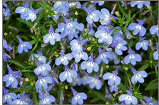
Techno Upright Light Blue Lobelia flowers