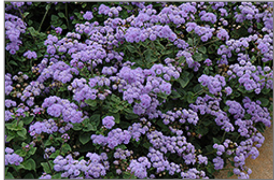
High Tide Blue Flossflower in bloom

High Tide Blue Flossflower will grow to be about 18 inches tall at maturity, with a spread of 16 inches. When grown in masses or used as a bedding plant, individual plants should be spaced approximately 12 inches apart. Its foliage tends to remain dense right to the ground, not requiring facer plants in front. This fast-growing annual will normally live for one full growing season, needing replacement the following year.