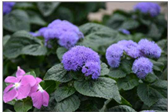
High Tide Blue Flossflower flowers