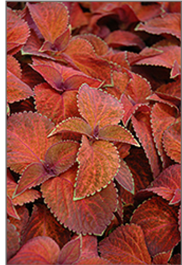
Wizard Sunset Coleus foliage

Wizard Sunset Coleus is recommended for the following landscape applications;