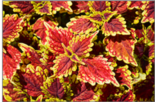
Oxford Street Coleus foliage