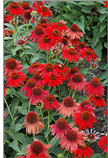
Sombrero Salsa Red Coneflower flowers

Sombrero Salsa Red Coneflower is recommended for the following landscape applications;