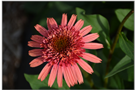
Supreme Flamingo Coneflower flowers