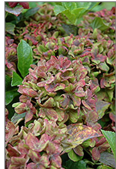
Pistachio Hydrangea flowers