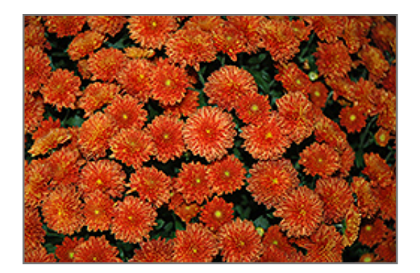
Daybreak Dark Bronze Chrysanthemum flowers