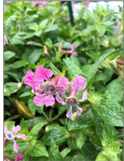
Sriracha Pink Cuphea flowers