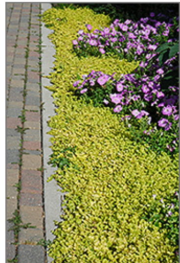
Golden Creeping Jenny