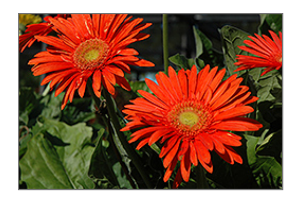
Funtastic Fire Orange Gerbera Daisy flowers