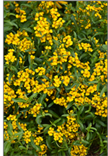
Mexican Tarragon flowers

Mexican Tarragon will grow to be about 30 inches tall at maturity, with a spread of 18 inches. Its foliage tends to remain dense right to the ground, not requiring facer plants in front. Although it's not a true annual, this plant can be expected to behave as an annual in our climate if left outdoors over the winter, usually needing replacement the following year. As such, gardeners should take into consideration that it will perform differently than it would in its native habitat.