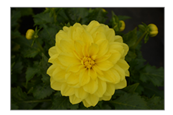
Dahlinova Hypnotica Yellow Dahlia flowers