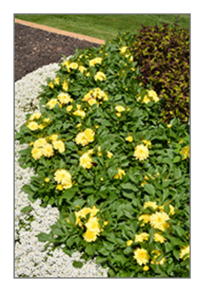
Dahlinova Hypnotica Yellow Dahlia in bloom