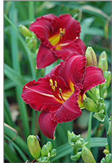
Pygmy Prince Daylily flowers