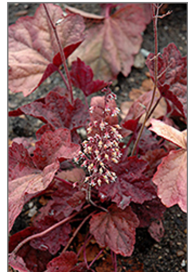
Lava Lamp Coral Bells flowers