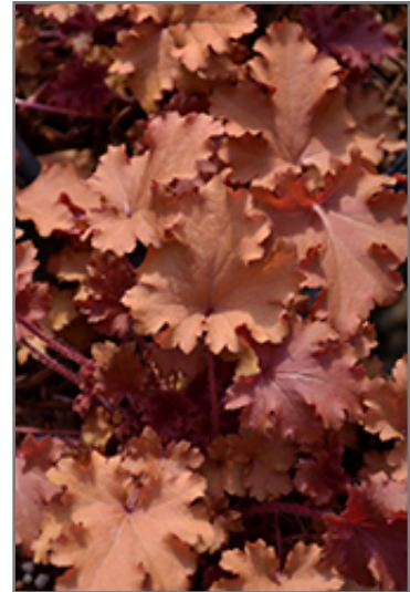
Peach Crisp Coral Bells foliage

Peach Crisp Coral Bells will grow to be about 14 inches tall at maturity extending to 20 inches tall with the flowers, with a spread of 18 inches. When grown in masses or used as a bedding plant, individual plants should be spaced approximately 15 inches apart. Its foliage tends to remain dense right to the ground, not requiring facer plants in front. It grows at a medium rate, and under ideal conditions can be expected to live for approximately 10 years. As an evergreen perennial, this plant will typically keep its form and foliage year-round.