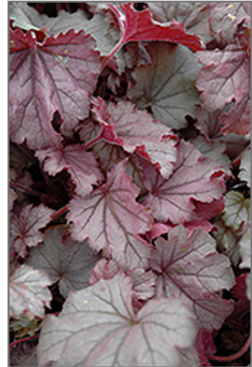
Little Cuties Sugar Berry Coral Bells foliage

Little Cuties Sugar Berry Coral Bells is recommended for the following landscape applications;