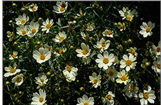
Star Cluster Tickseed flowers