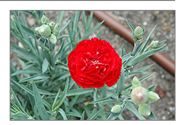
Can Can Scarlet Carnation flowers

Fully double scarlet carnations with fringed petal edges bloom consistently over a long season, especially in warmer climates; great for border fronts, containers, and floral arrangements