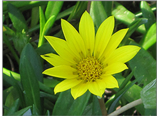
Trailing Gazania flowers