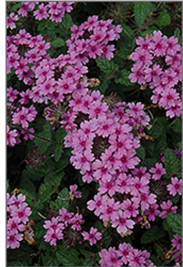
EnduraScape Lavender Verbena flowers