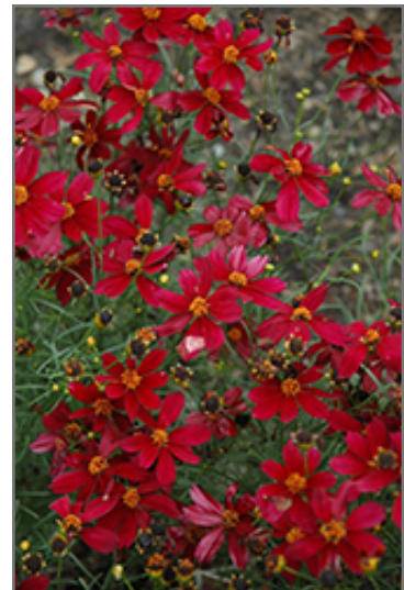
Red Satin Tickseed in bloom