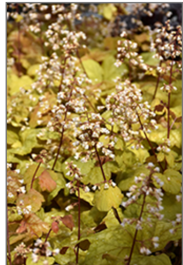
Champagne Coral Bells flowers