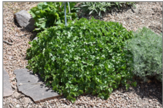
Sandia Coral Bells