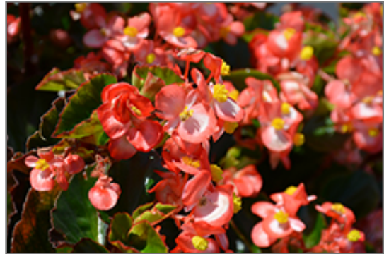
BabyWing Bicolor Begonia flowers