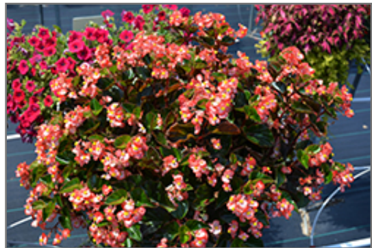
BabyWing Bicolor Begonia in bloom