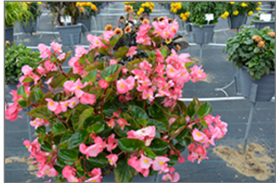
Big Pink Green Leaf Begonia in bloom

Big Pink Green Leaf Begonia is a fine choice for the garden, but it is also a good selection for planting in outdoor containers and hanging baskets. It is often used as a 'filler' in the 'spiller-thriller-filler' container combination, providing a mass of flowers and foliage against which the larger thriller plants stand out. Note that when growing plants in outdoor containers and baskets, they may require more frequent waterings than they would in the yard or garden.