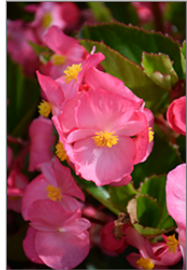
Big Pink Green Leaf Begonia flowers